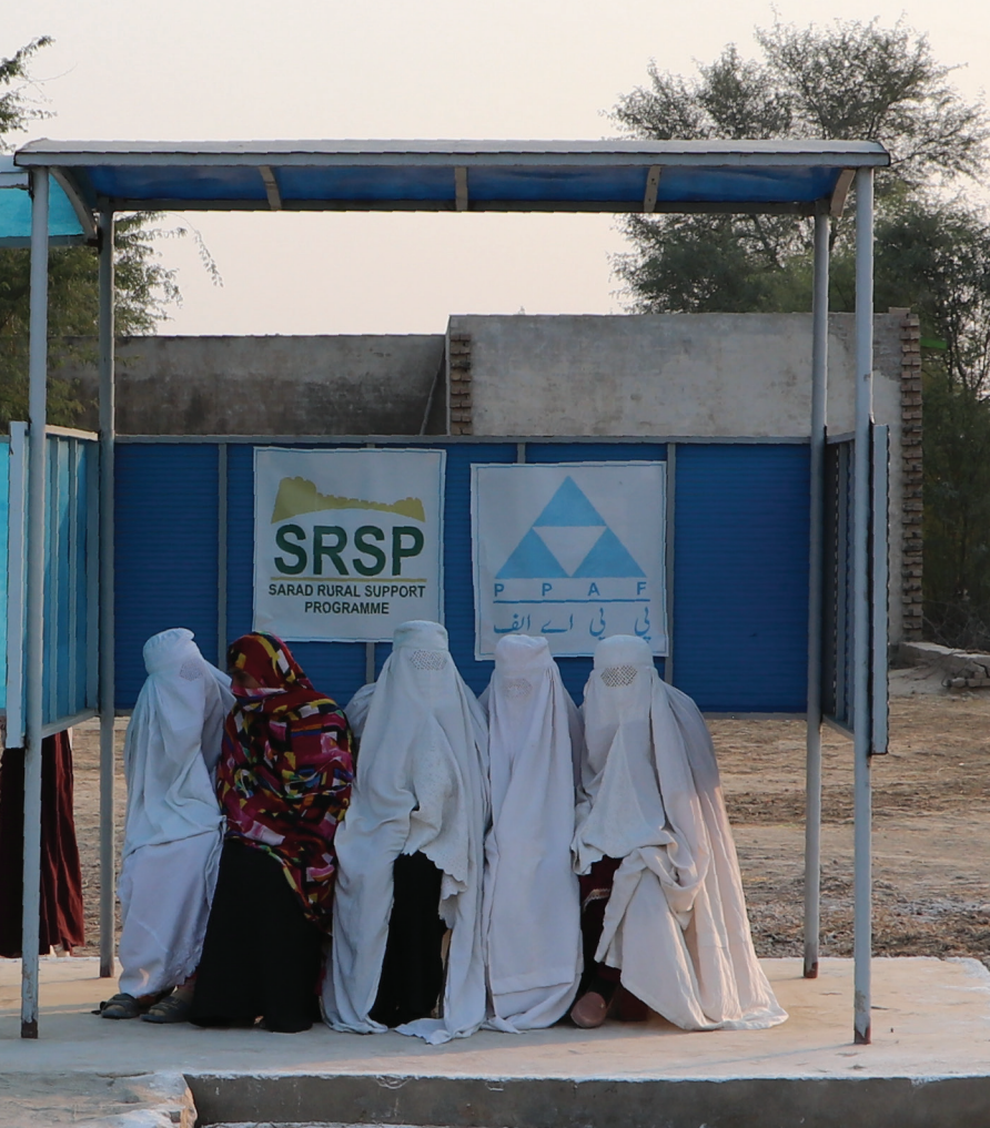
Community women waiting at the bus stand built through the LACIP-II, enhancing safe travel and community inclusion.

LACIP is an integrated poverty reduction programme funded by Federal Republic of Germany through KfW that aims to contribute towards the improvement of living conditions of vulnerable communities by building disaster-resilient Community Physical Infrastructure (CPI) and generating employability through Livelihood Enhancement and Protection interventions with Institutional Development as the basis for all the activities. PPAF is the lead implementing agency of LACIP through its Partner Organisations (POs).